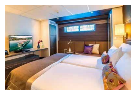
Stateroom Haydn Deck (172 sf)

Notes - Excursions require moderate walking with some stair climbing possible. -Hotel/Ship Check in time in Europe typically begins between 3-4 pm.