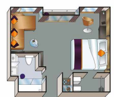
Suite Mozart Deck (284 sf)