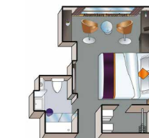
Stateroom Strauss & Mozart Decks (188 sf)