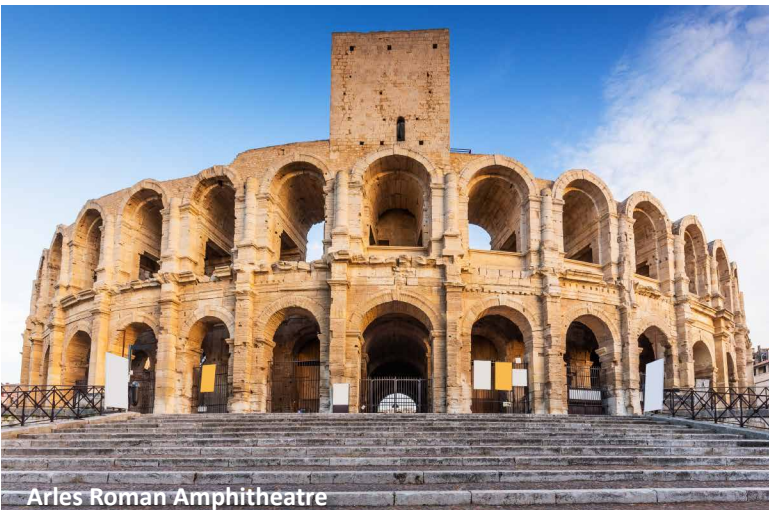
Arles Roman Amphitheatre